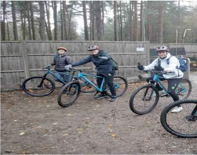
Resilience and perseverance trip to high lodge