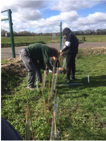
Support community garden projects